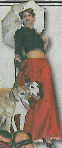
Jacket by Kissy Kissy and dogs from the Greyhound Adoption League of Texas

Feb. 23: From the streets of Paris to the clubs of New York, from '60s bohemian to present-day trends, DIFFA jackets stole the show during an evening of high energy and non-stop entertainment. The Trinity Ballroom of the Hilton Anatole transformed into Studio 54 to thrill supporters of AIDS research organizations in North Texas. After a performance with models, gospel singers, acrobats, and dancers, the partygoers moved over to the after-party, where the champagne flowed as movers and shakers hit the dance floor.